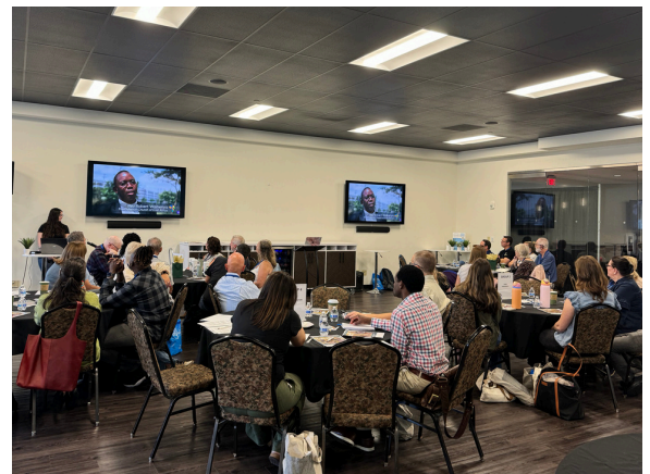
Christian Alliance for Orphans Training